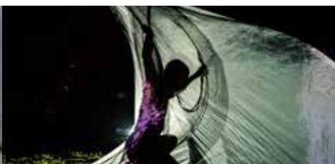
IMF 2016 VALPARAISO – Chile – Arquitectura indeterminada y arquitecturas del control. metabody.eu/imf2016chile/