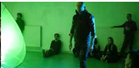
IMF 2016 AMSTERDAM – Metabotics. metabody.eu/imf-2016-amsterdam