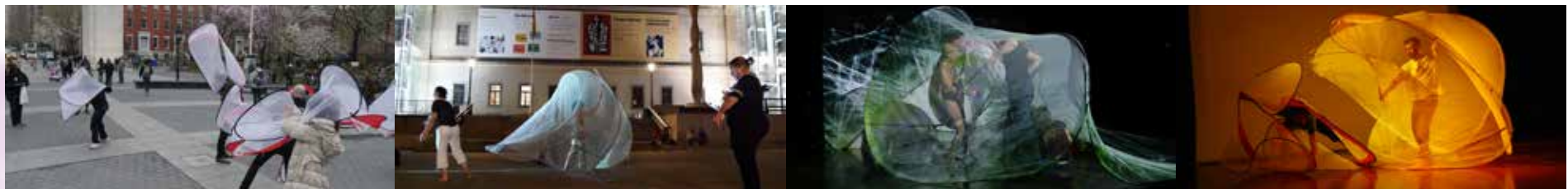
IMF 2015 USA-CANADA – Duke University, Durham – Concordia University, Montreal – NYIT, New York – U.C.Berkeley – Reversing Cybernetics, Queering Control. www.metabody.eu/imf-2015/#usa2015