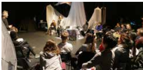
IMF 2016 LONDON – Performance Architectures, Wearables & Gestures of Participation. metabody.eu/imf-2016-london