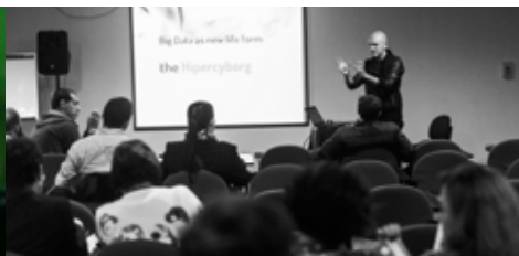
IMF 2016 MANIZALES, COLOMBIA – Ecologies of Perception. metabody.eu/imf2016colombia/