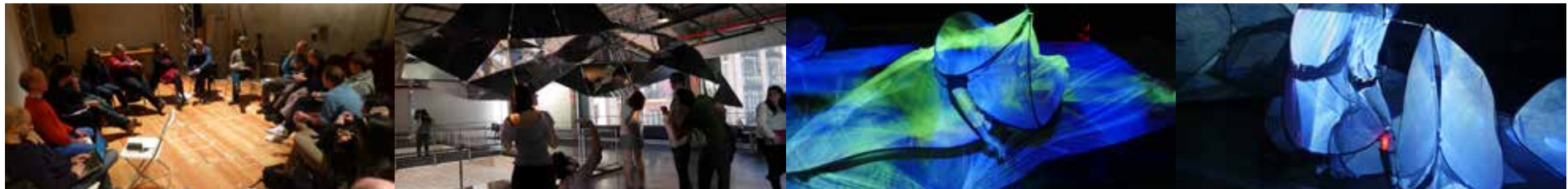
IMF 2014 GENOA – New Interfaces for expressive movement. www.metabody.eu/imf-2014/#genova2014