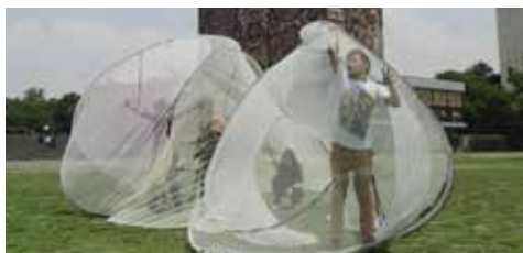
IMF 2016 MEXICO D.F. – Towards an open ecology: disaligning violence. metabody.eu/imf2016mexico/