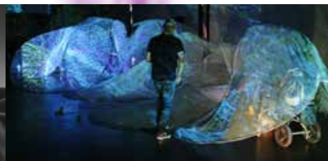
IMF 2016 MADRID – Posthuman Studies and Technologies of Control. metabody.eu/imf-2016-madrid/