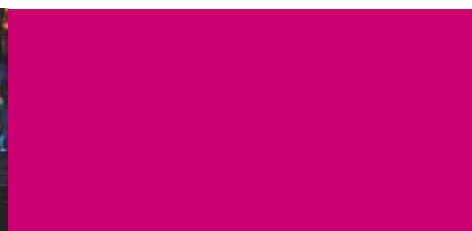
FORTHCOMING / CURRENT EDITION IMF 2017 – Algoricene: ecologies of indeterminacy in the Big Data Era. www.metabody.eu/imf-2017