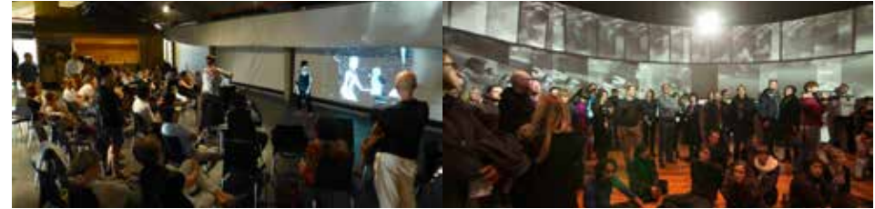
IMF 2013 MADRID – Multiplicities in Motion: affects embodiment and the reversal of cybernetics. 3.000 years of posthuman history. metabody.eu/forum/imf-2013