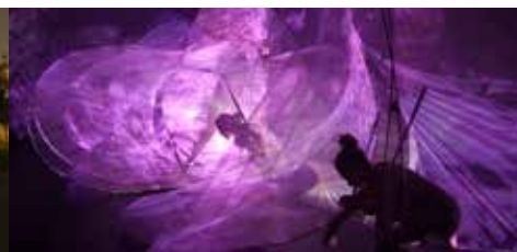
IMF 2016 TOULOUSE – Metaformance-Metagaming. metabody.eu/imf2016toulouse/