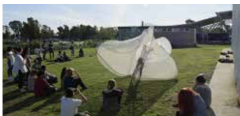
IMF 2016 BUENOS AIRES & MONTEVIDEO – Metatherapies: expanded bodies, dynamic spaces and plural ecologies. metabody.eu/imf2016argentina-uruguay/