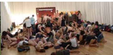
IMF 2016 BERLÍN – Microsexes and Post-intimacy, alien couplings and emergent tactilities. metabody.eu/imf2016berlin/