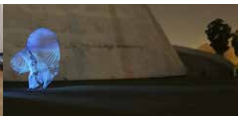
IMF 2016 BRASILIA, SÃO PAULO & SÃO CARLOS – Mobile Architectures. metabody.eu/imf2016brasil/