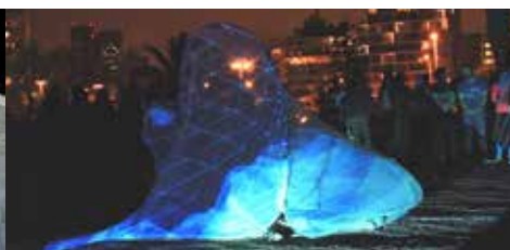
IMF 2016 LIMA – PERÚ – Cuerpos abiertos y estrategias de Ontohacking. metabody.eu/imf2016lima/